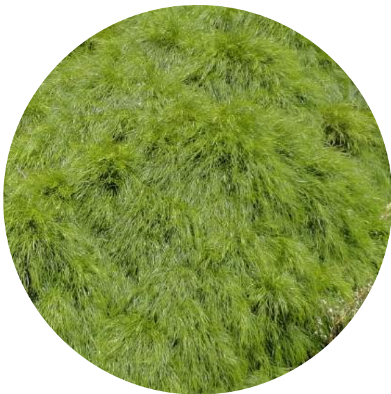
Acacia cognata 'Limelight'