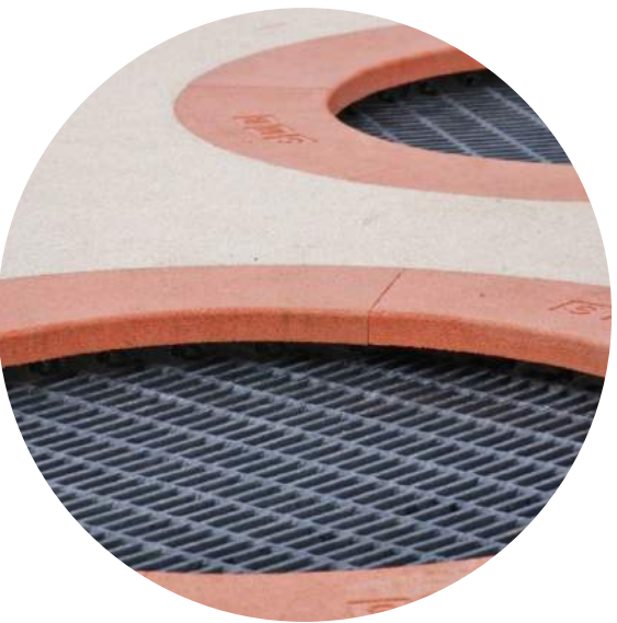
MINI TRAMPOLINE 3-5 year olds, 5-8 year olds, 8-12 year olds