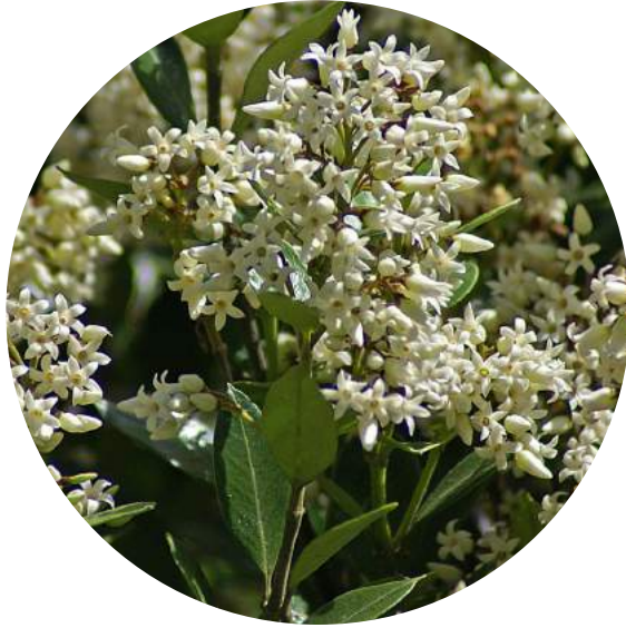
Parsonsia heterophylla - NZ Jasmine