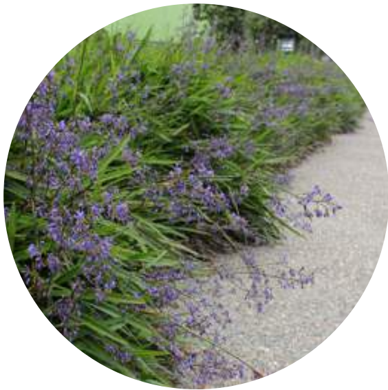
Dianella 'Little jess'