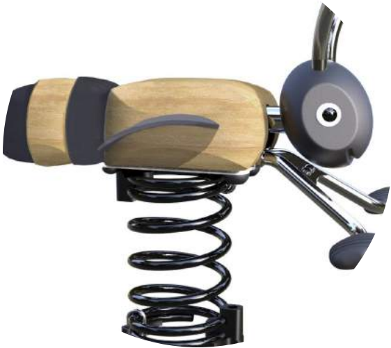
BEE SPRINGER 3 - 5 year olds, 5 - 8 year olds