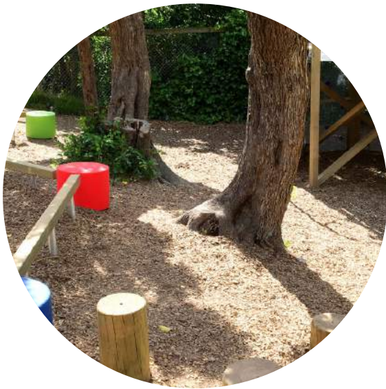
WOODEN STEPPING LOGS (PAINTED) 1 - 3 year olds, 3 - 5 year olds, 5 - 8 year olds