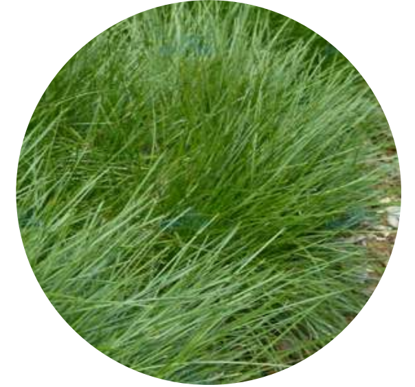
Lomandra 'Little con'