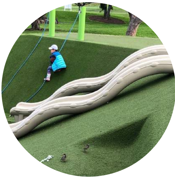
SLIDE 3-5 year olds, 5-8 year olds, 8-12 year olds