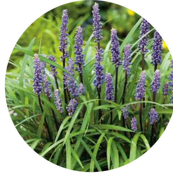
Liriope muscari 'Evergreen giant'