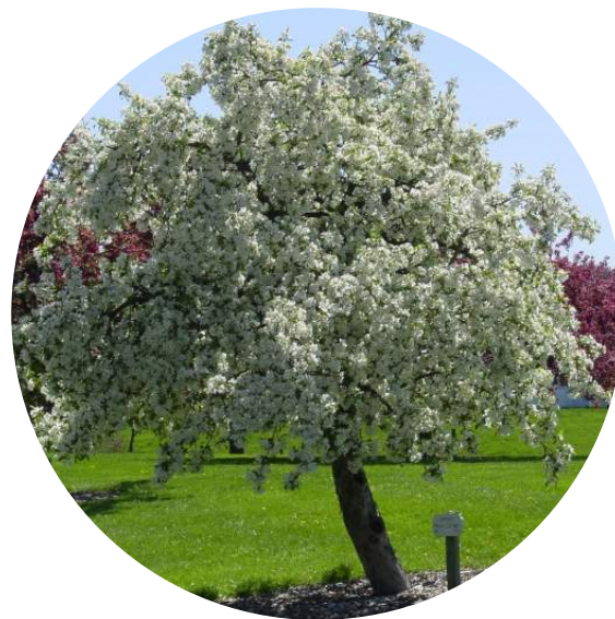
Malus spp. 'Apple'