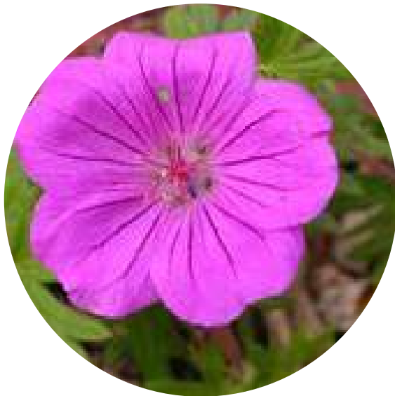
Geranium 'Tiny monster'