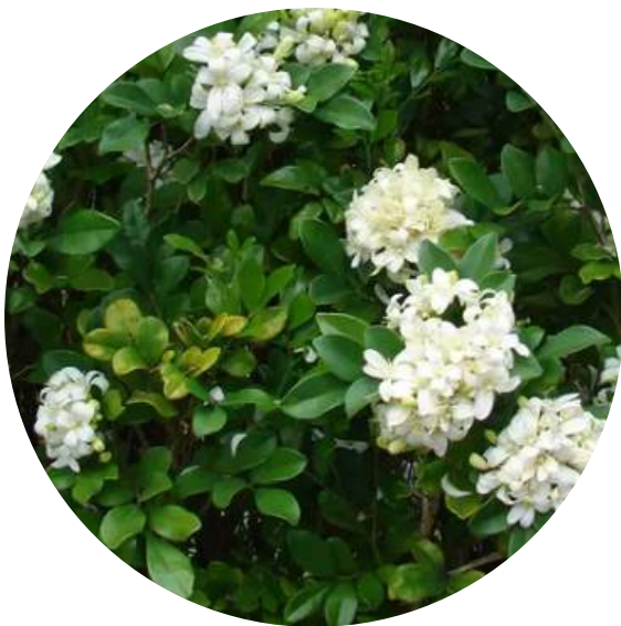
Murraya paniculata 'Orange jessamine'