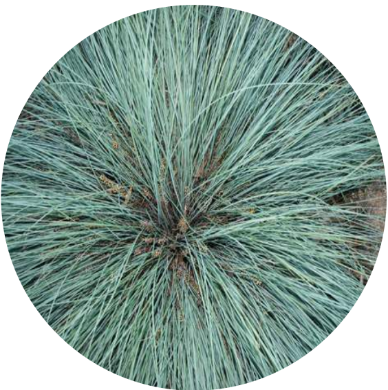
Lomandra 'Silver grace'