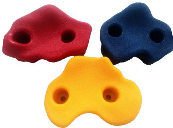
HANDHOLDS 3-5 year olds, 5-8 year olds, 8-12 year olds