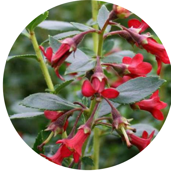
Escallonia 'Red elf'