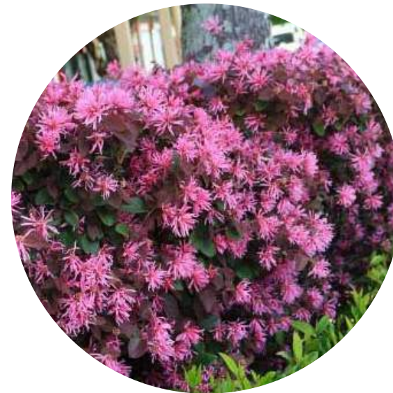
Loropetalum chinense 'China pink'