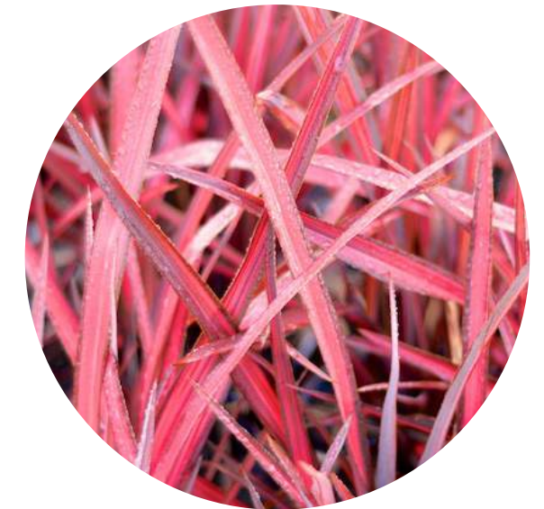
Phormium 'Evening glow'