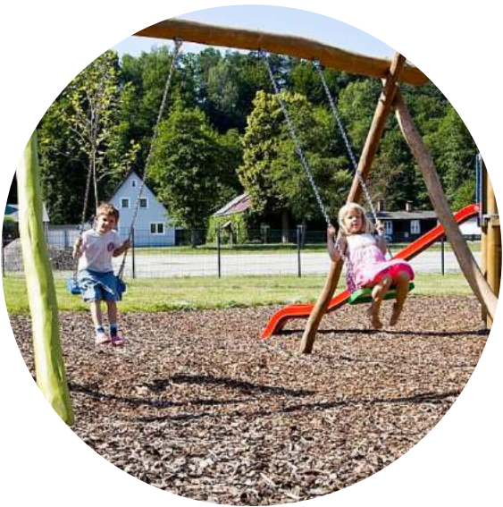
TWO SEAT SWING 1 - 3 year olds, 3 - 5 year olds, 5 - 8 year olds, 8 - 12 year olds