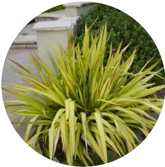
Phormium 'Yellow wave'